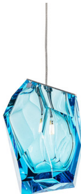
Shown in: White / Blue

The Crystal Rock Pendant's contemporary appeal beautifully blends the line between nature and man, light and reflection, transparency and mass. Perfectly cut and roughly sculpted hunks of hand-blown Czech polished surface glass give the Crystal Rock its stunning profile. Reflections of light dance to-and-fro and add a characteristic that makes the Crystal Rock absolutely unique. Place this stunning work of art anyplace in the home in need of fascinating sophistication. UL listed. Made in Czech Republic. Available in a 1-light, 3-light or 5-light with glass available in all Blue, Opal, Amber, Clear, or Red (all same color) with an organic shape White canopy. Custom options available upon request.