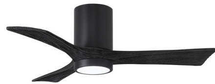
Shown in matte black / matte black

LAMP LIFE . . . . . 60000 hours COLOR RENDERING . . . . . 90 CRI LAMP COLOR . . . . . 3075K LUMENS/WATT . . . . . 43.13 LUMINOUS FLUX . . . . . 690 lumens