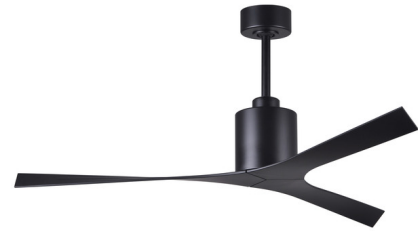
Shown in matte black