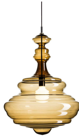
Shown in black / smoke

PRODUCT DIMENSIONS . . . . . Canopy: 4.5" diameter COLOR RENDERING . . . . . 95 CRI LAMP COLOR . . . . . 2200K LUMENS/WATT . . . . . 80.00 LUMINOUS FLUX . . . . . 480 lumens