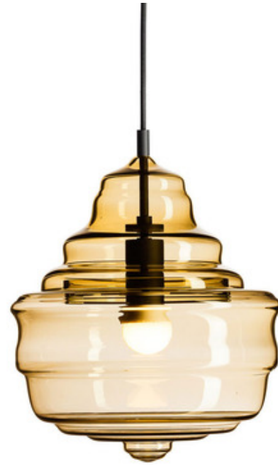
Shown in: Black / Smoke

The Neverending Glory / Palais Garnier Pendant takes its name from one of the world's most eminent concert halls in Paris. Visually speaking, the Palais Garnier's incredible silhouette revolves around an axis and creates an iconic look that is sure to turn heads. Artisan touches in the hand-blown Czech glass give each Palais Garnier its own uniqueness.