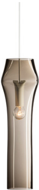
Shown in: White / Smoke

The Press Pendant emphasizes practical beauty and the universal appeal of hand-crafted work. Inspired by contemporary Japanese design, the Press's hand-blown Czech Glass tube is pressed and pinched to give it its soft, organic form. Place the Press over the dining room table, in multiples through an entryway, or anywhere where layered lighting is needed.