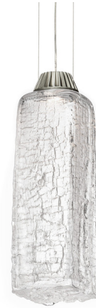
Shown in brushed stainless steel / clear

The Yakisugi Pendant's unique profile crosses between ancient techniques and contemporary design. The Japanese surface burning technique, known as Yakisugi, inspires the incredible details throughout this hand-blown Czech glass fixture. Place the Yakisugi over the dining table, in an entryway, or anyplace where superior sophistication is needed. Available in two sizes. UL listed. Made in Czech Republic.