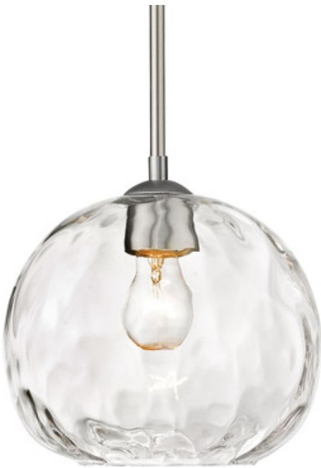
Shown in: Brushed Nickel / Clear

The Chloe Pendant defines your modern space with eye catching streamlined presence of its contemporary shape. Metal finish is complemented by grooved rounded shade made from clear water textured glass which is suspended from a sleek steel frame.