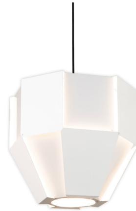
Shown in gloss white