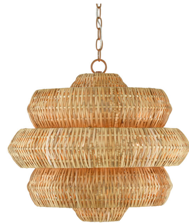
Shown in khaki / natural

PRODUCT DIMENSIONS . . . . . Canopy: 6" Dia.