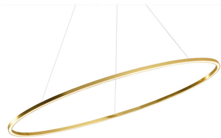
Shown in gold painted / opal

COLOR RENDERING . . . . . 85 CRI LAMP COLOR . . . . . 2700K LUMENS/WATT . . . . . 32.96 LUMINOUS FLUX . . . . . 1780 lumens