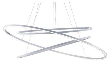
Shown in polished aluminum / opal

PRODUCT DIMENSIONS . . . . . Cable Length: 98" COLOR RENDERING . . . . . 85 CRI LAMP COLOR . . . . . 2700K LUMENS/WATT . . . . . 67.14 LUMINOUS FLUX . . . . . 4700 lumens