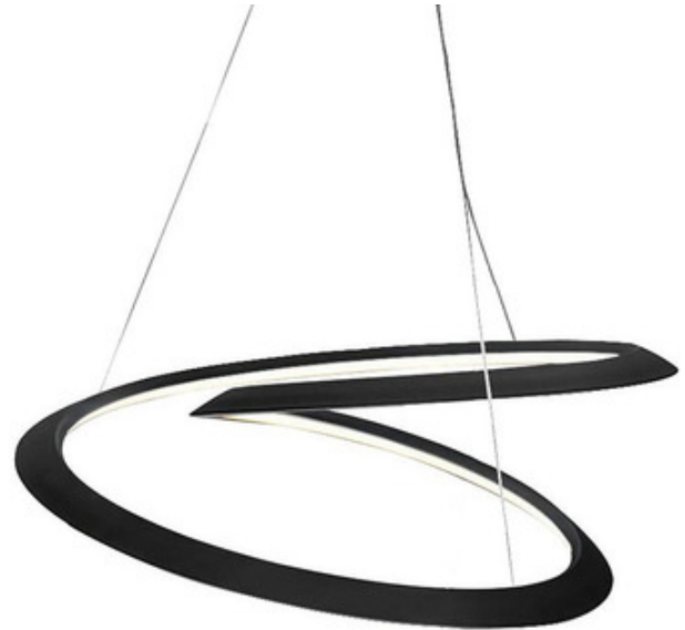
Shown in: Matte Black

The Kepler Minor Pendant, with uplight or downlight, is an endless line made through a 3 dimensional deformation process of extruded aluminum, designed using the mathematics of Moebius ribbons. The pendant's spiraling structure is lined with an LED strip to cast light in all directions.