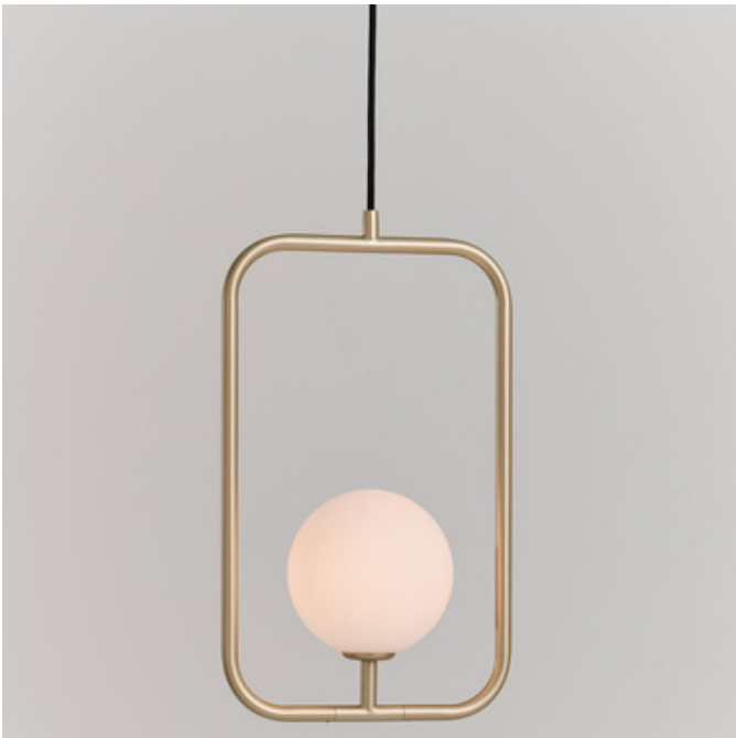
Shown in: Champagne Gold / Opal

The Sircle Pendant is inspired by the East aesthetic philosophy with a merged square and circle. The circular aspect conceals an integrated LED light and works harmoniously with the rigid frame surrounding it. The light can be positioned inside or outside of the square. Available in two sizes with a Champagne Gold or Matte Black finish. ETL listed, title 20 compliant.