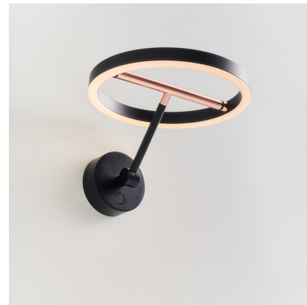
Shown in matte black / shiny copper

The SOL Wall Sconce has a low-key design with elaborate consideration. The ring like shade is finely affixed to a metallic luster balance bar, demonstrating the definition of understated luxury. The adjustable ring tilt allows the pendant to function almost like a planet floating around stars. The invisible LED strip makes the light source impeccable, with a gradual dimming capability, rendering it possible for you to re-create your own personal sunrise and sunset. Available in Matte Black with Shiny Copper with a black textile cord. Includes a touch dimmer on the backplate of the fixture.