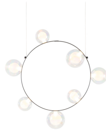
Shown in nickel / oil iridescent

The Hubble Bubble brings back childhood memories of blowing bubbles and running barefoot on the lawn. The Integral LED modules are powered through Electrosandwich, created by Marcel Wanders. This technique uses thinly coated conductive layers that enable the LEDs to draw low voltage current from the frame. Available in oil-iridescent or frosted glass with a Nickel finish, The Hubble Bubble can be hung both horizontally and vertically. Dimmable with Trailing Edge and Reverse Phase dimmers.