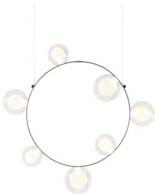
Shown in: Nickel / Oil Iridescent

The Hubble Bubble brings back childhood memories of blowing bubbles and running barefoot on the lawn. The Integral LED modules are powered through Electrosandwich, created by Marcel Wanders. This technique uses thinly coated conductive layers that enable the LEDs to draw low voltage current from the frame. Available in oil-iridescent or frosted glass with a Nickel finish, The Hubble Bubble can be hung both horizontally and vertically. Dimmable with Trailing Edge and Reverse Phase dimmers.