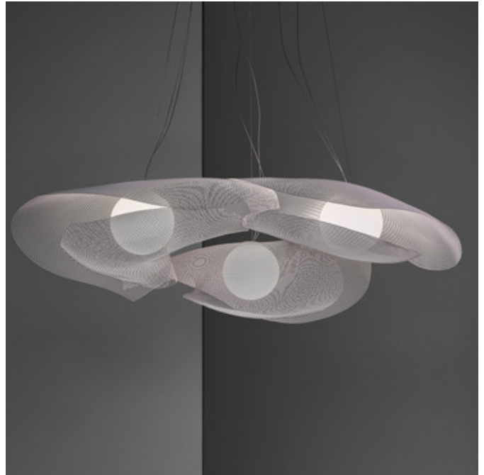
Shown in: Stainless Steel / White

The Mytilus Pendant takes inspiration from movement of the seafloor. Majestically full of life, the Mytilus waves like the mysterious and eternal ocean currents. This contemporary design is constructed of painted Stainless Steel Mesh and features integrated LEDs that will work wonderfully in a variety of spaces.