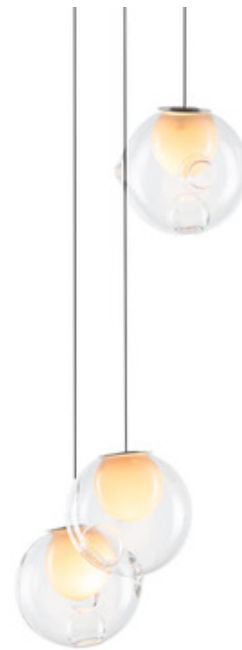
Shown in: Brushed Nickel / Clear

Series 28 is an exploration of specificity in manufacturing. Instead of designing form itself, the intent was to design a system of making that yields form. Individual 28 forms result from a complex glass-blowing technique whereby air pressure is intermittently introduced into and then removed from a glass matrix which is intermittently heated and then rapidly cooled. The result is a distorted spherical shape with a composed collection of imploded inner shapes, one of which acts as a shade for the light source. Available with 1.5W LED or 20W Xenon lamping. Choice of three, five, or seven pendants on a round Brushed Nickel or powder-coated White canopy. Each pendant includes 10 feet of adjustable coaxial cable. Bocci recommends mounting power supplies remotely in an easily accessible and hidden location for ease of long-term maintenance as well as providing a robust 5/8 inch plywood backing in the ceiling for secure installation.