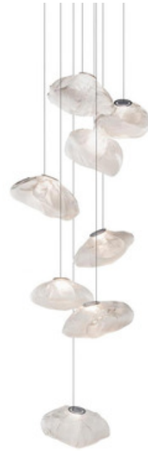
Shown in: White / Clear

Series 73 results from blowing liquid glass into a folded and highly heat-resistant ceramic fabric vessel. The resulting shape has a formal and textural expression intuitively associated with fabric, which becomes permanent and rigid as it cools. Due to the hand-crafted nature of the 73 series, the size as well as color depth and tonality will vary. Available with 1.5W LED or 10W Xenon lamping. Choice of Clear or three different shades of Grey glass with a powder-coated White canopy. Upon ordering, the length of the shortest and longest pendants must be provided. Bocci will create a random selection of lengths throughout the minimum and maximum range provided - see pictured measurement guide. Made in North America. Bocci recommends mounting power supplies remotely in an easily accessible and hidden location for ease of long-term maintenance as well as providing a robust 5/8 inch plywood backing in the ceiling for secure installation. Cables are not adjustable on site.