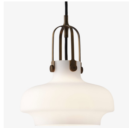
Shown in bronzed brass / opal

The Copenhagen Pendant carries an industrial feel yet is elegant and poetic at the same time. An exercise in contrasts, it combines the classic and the modern, the maritime and the industrial. It is available with either a mouth-blown Opal glass shade that creates a diffused warm glow, or a Matte Black spun metal shade for a more directional up and down light. Placed in an office or over a dining table, the Copenhagen provides instant ambiance with sophistication. Non-UL versions have a black fabric cord, while the UL versions have a black PVC cord. Note: The 23.6 inch size is only available with a Matte Black shade. The non-UL version of the 7.8 inch size includes an internal glass diffuser to cover the G9 base bulb. The UL-listed version requires a candelabra base bulb, which the diffuser will not fit.