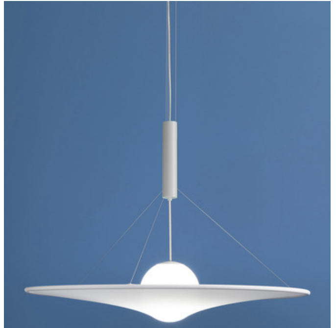
Shown in: Light Grey / White

The Manto Pendant designed by Davide Besozzi, features a movable Blown Opaline glass globe that is complemented by a removable fabric diffuser to create a variety of different lighting looks. The globe can be positioned up or down to accentuate your space, or seem to push through the fabric diffuser to bring an out of this world look to your area. Includes 120-277V driver, dimmable with a 0-10V dimmer.