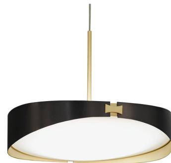
Shown in satin graphite / satin brass / white

PRODUCT DIMENSIONS . . . . . Cable Length: 79" LAMP COLOR . . . . . 2700K LUMENS/WATT . . . . . 48.57 LUMINOUS FLUX . . . . . 1700 lumens