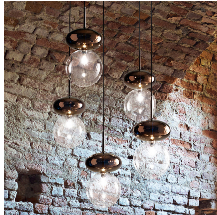
Shown in glossy black chrome / transparent

The Unica Hanging Floor Lamp features a spherical Clear Borosilicate Glass shade that is complemented by a reflective bronze elliptical shape making it extremely versatile and full of charm while maintaining a simple and striking appearance. Looks great by itself or when paired with multiples. CE listed.