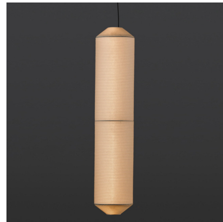
Shown in white / japanese washi paper

The Tekio Pendant merges ancient artisan techniques with modern technology to deliver the avant-garde in contemporary lighting. Inspired by traditional Japanese lanterns, the Tekio's Washi Paper body is resilient and ductile, even malleable. Once illuminated, the integrated LEDs with Warm to Dim technology (2700K to 2200K) boasts a warm texture that filters in a soft, gentle light. Available in four sizes. UL and CE listed. Use a dry cloth to wipe the shade. The paper is treated with wax, making it easier to clean than untreated washi paper, but a wet cloth should not be used.