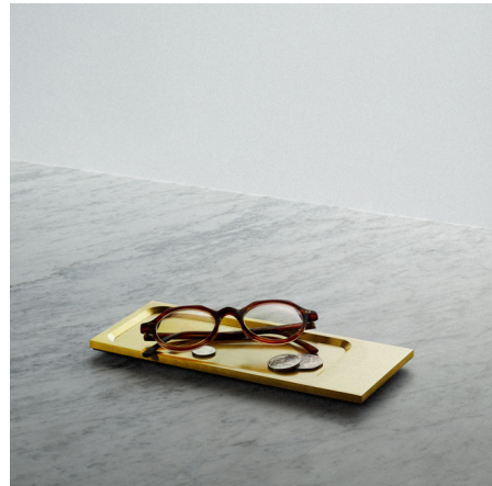
Shown in brass

The Machined Tray by Buster + Punch is constructed of solid metal to accommodate interior accessories. To remove dust: Wipe with soft dry cloth in the same direction as the brush pattern to avoid scratching the metal.