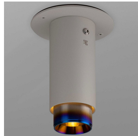
Shown in stone / burnt steel

The Exhaust Surface Spot is a fixed spotlight featuring the Buster + Punch signature linear or cross pattern knurl baffle that captures light and creates a delicate metallic glow. An included honeycomb filter emits a precise, non-glare, fixed downlight spot. Available with a Graphite or Stone finish with a matching flush canopy complemented by a variety of baffle finishes. Note: Not all finish combinations are available.