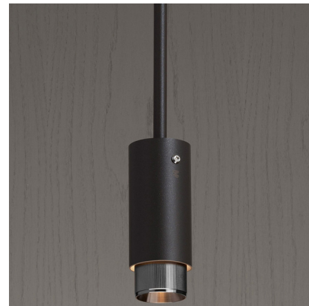
Shown in graphite / steel

The Exhaust Pendant features the Buster + Punch signature linear or cross pattern knurl baffle that captures light and creates a delicate metallic glow. An included honeycomb filter emits a precise, non-glare, directional spotlight. Available with a Graphite or Stone finish and matching flush canopy complemented by a variety of baffle finishes. Note: Not all finish combinations are available.