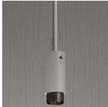
Shown in stone / gun metal

The Exhaust Pendant features the Buster + Punch signature linear or cross pattern knurl baffle that captures light and creates a delicate metallic glow. An included honeycomb filter emits a precise, non-glare, directional spotlight. Available with a Graphite or Stone finish and matching flush canopy complemented by a variety of baffle finishes. Note: Not all finish combinations are available.