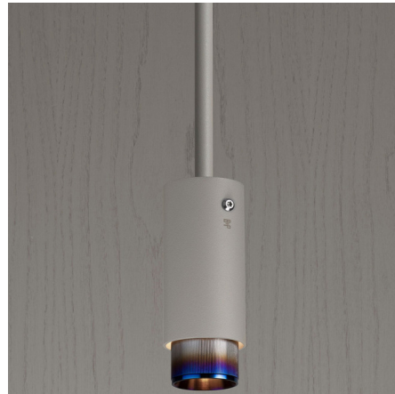
Shown in stone / burnt steel

The Exhaust Pendant features the Buster + Punch signature linear or cross pattern knurl baffle that captures light and creates a delicate metallic glow. An included honeycomb filter emits a precise, non-glare, directional spotlight. Available with a Graphite or Stone finish and matching flush canopy complemented by a variety of baffle finishes. Note: Not all finish combinations are available.