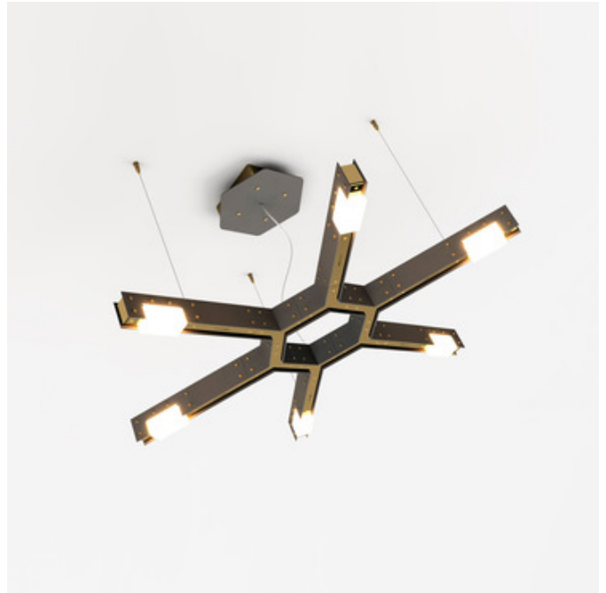
Shown in: Blackened Brass / Brushed Brass

The Cubi Chandelier features an industrial design crafted from steel panels that are held together with metal screws. Available in two sizes with a Blackened Brass finish complemented by Brushed Brass screws. Includes 6 inch US canopy with transformer. UL listed.