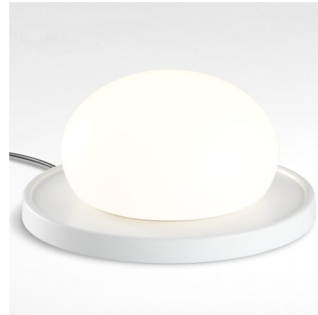
Shown in white / white

COLOR RENDERING . . . . . 90 CRI LAMP COLOR . . . . . 2700K LUMENS/WATT . . . . . 121.83 LUMINOUS FLUX . . . . . 731 lumens