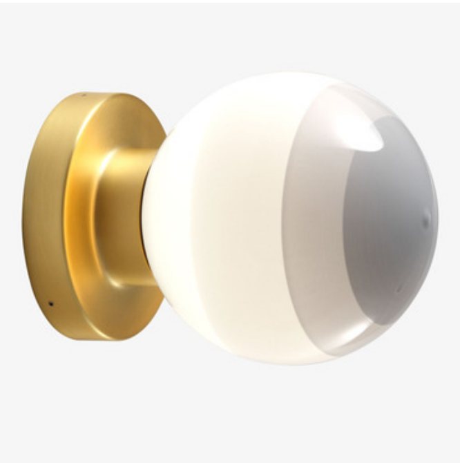
Shown in: Brushed Brass / Off White

The Dipping Light Wall Sconce seeks to excite. Each lamp illuminates with different shades of light depending on the paint color, creating a wide range of ambient lights that can match any decor. When it's turned on, its different shades of paint shift the light, creating a magical ambient effect. When it's off, the colored glass sphere is an object charged with beauty and eye-catching design. Available in blown glass layered in Green, Amber, Pink, Off White, or Blue with a Brushed Brass, or Graphite finish. NOTE: UL certification pending.