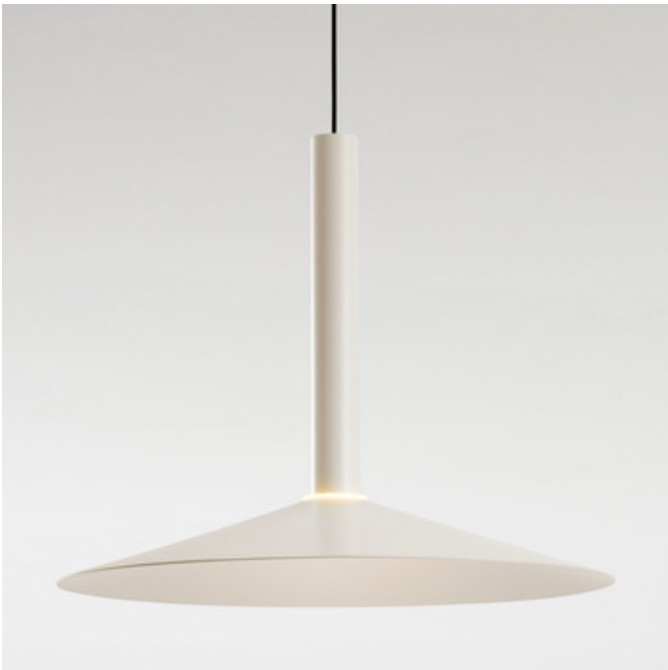
Shown in: Off White

The Milana Counterweight Pendant's design starts with the deconstruction of the archetype of a lamp, by synthesizing it as much as possible bringing it to only the necessary elements. The counterweight allows you to quickly and easily adjust the position of the pendant. Includes dimmable LED module and driver. Available in two sizes with a White, Black, Beige, Grey, or Red aluminum finish shade with a polycarbonate diffuser. UL listed. NOTE: CANOPY IS RECESSED AND REQUIRES A REMOTE LOCATION FOR LED DRIVER.