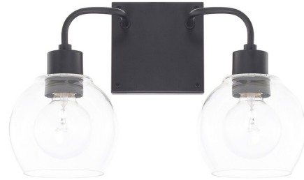
Shown in matte black / clear

The Tanner Bathroom Vanity Light brings a simple, clean look to a variety of interior styles. The slim lines and smooth curves of the frame are complemented by Clear glass shades. Available with a Brushed Nickel, Bronze, and Matte Black finish in 2, 3, and 4 light options. Damp location rated. UL listed.