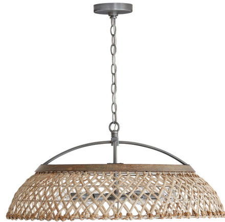
Shown in antique nickel