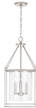
Shown in brushed nickel / clear seeded

PRODUCT DIMENSIONS . . . . . Chain Length: 120"