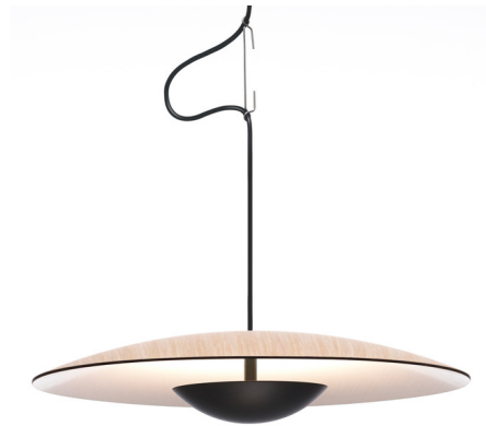
Shown in matte black / oak / white interior

COLOR RENDERING . . . . . 90 CRI LAMP COLOR . . . . . 2700K LUMENS/WATT . . . . . 33.24 LUMINOUS FLUX . . . . . 698 lumens