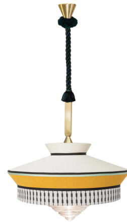
Shown in matte gold / yellow multi

PRODUCT DIMENSIONS . . . . . Cable Length: 78.7" COLOR RENDERING . . . . . 90 CRI LAMP COLOR . . . . . 2100K