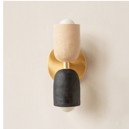
Shown in brass canopy / tan clay upper shade

The petite and unobtrusive Ceramic Up Down Wall Sconce emits a soft glow both up and down the wall. Available in 175 different combinations. Each ceramic shade is handmade and left raw or pigmented. Includes Warm Dim bulb which changes in color from 3000K to 2200K as it is dimmed. Please select a canopy finish, an upper shade color, and a lower shade color.