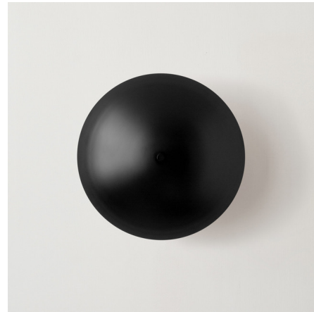
Shown in black / black shade

The Arundel Wall / Ceiling Light features a shade that appears to be the tip of a sphere sliced halfway between the center and top of the sphere shining light back towards the surface it is mounted on. Hardwire and Plug-In versions available. Plug-In version supplied with 16 ft. of cord with an inline dimmer.