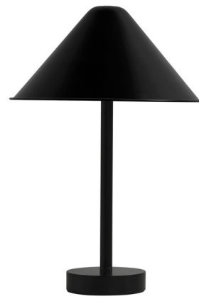
Shown in black / black shade

LAMP LIFE . . . . . 30000 hours COLOR RENDERING . . . . . 95 CRI LAMP COLOR . . . . . 3000K Warm Dim LUMENS/WATT . . . . . 110.00 LUMINOUS FLUX . . . . . 440 lumens