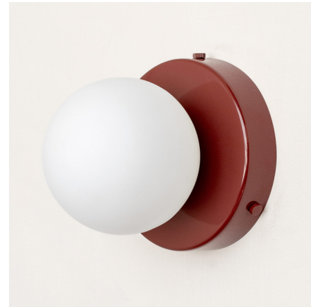
Shown in oxide red / white

The Orb Surface Mount features a clean and simple design with a round backplate in a variety of finish options. Paired with a blown Opal glass diffuser. Mount on the wall or the ceiling, anywhere an ambient orb of light is desired.