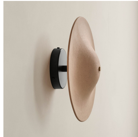
Shown in black canopy / tan clay shade

The Alien Surface Mount is a sculptural masterpiece, perfect in a variety of spaces in your home. Featuring a handcraft ceramic shade by draping a slab of clay over a press mold. Perfect alone or group together for a dramatic look. Plug-in includes 8 foot cord. Note: Due to the handmade nature of this product, dimensions may vary within one inch.