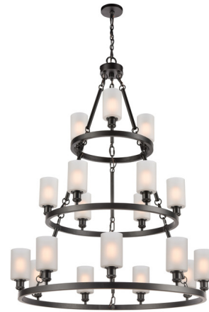
Shown in matte black / matte white

The Saloon Trio Chandelier brings a clean farmhouse look to a variety of interior spaces. A trio of smooth Matte Black frames, held by metal straps, is highlighted by Matte White glass cylinder shades or bare bulbs. Available with Incandescent or LED lamping. Canopy: 5 inch diameter. Damp location rated. UL listed.