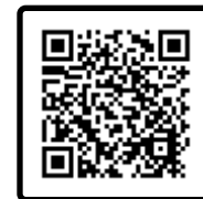
CLICK TO VIEW PRODUCT