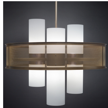
Shown in bronze age / opal

PRODUCT DIMENSIONS . . . . . Overall Height: 53"