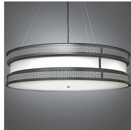
Shown in dark iron / opal

The Duo Double Band Pendant brings a clean detailed look to a variety of interior styles. The drum shaped diffuser is complemented by a patterned band on the top and bottom that casts unique lighting across your space. Options include an Opal acrylic, Faux Alabaster, or White Swirl diffuser and bands with a Round, Angles, or Cloverleaf pattern in a Cast Bronze, Black, Satin Pewter, Dark Iron, or Bronze Age finish. Available with Incandescent or integrated LED lighting options. Canopy: 8 inch diameter. Made in the USA. Damp location rated. UL and cUL listed.