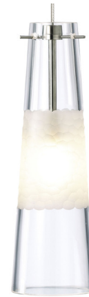
Shown in satin nickel / clear