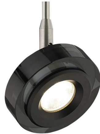
Shown in matte black / clear