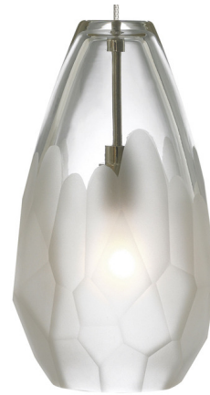
Shown in satin nickel / frost