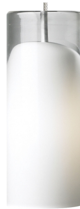
Shown in satin nickel / frost